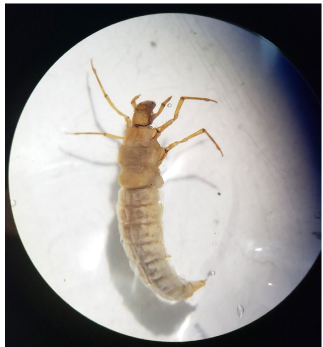
FIGURE 1 Picture of Phylloicus sp. (Trichoptera: Calamoceratidae) observed electronic magnifier glass

In the experiment, we used 80 containers (Cerrado = 40; Amazonia = 40) with a single Phylloicus larvae to avoid interactions between individuals (e.g., aggression and competition) that could interfere in the consumption results. The effect of litter quality was assessed by providing leaf litter of M. guianensis and I. laurina in five different ratios of number of disks (A = 100% of M. guianensis ; B = 75% of M. guianensis , and 25% of I. laurina ; C = 50% of both; D = 25% of M. guianensis and 75% of I. laurina ; and E = 100% of I. laurina ) to Phylloicus larvae. These five ratios were repeated in two treatments regarding the quantity of organic matter where the first with four leaf disks (Lower quantity) and the second with 12 leaf disks (Higher quantity) in each container highlight that there were 4 replicates per quantity × quality treatment level in the text (as shown in Figure 2).